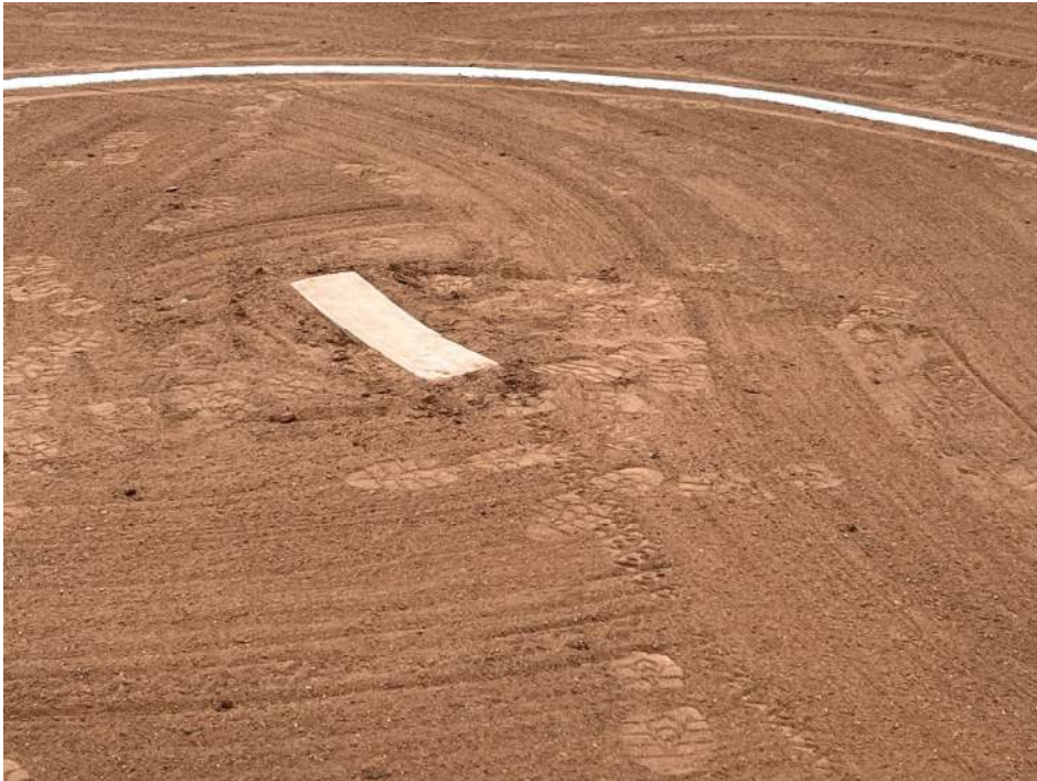
Typical existing softball pitcher's mound – Add clay and new mount plate