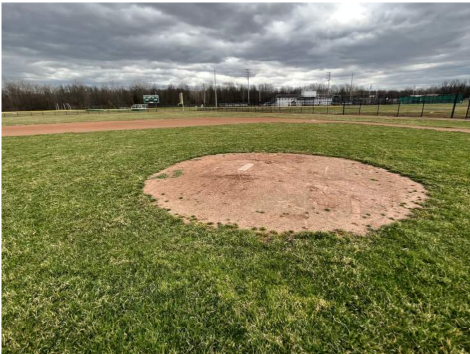
Varsity pitcher's mound – To be reconstructed