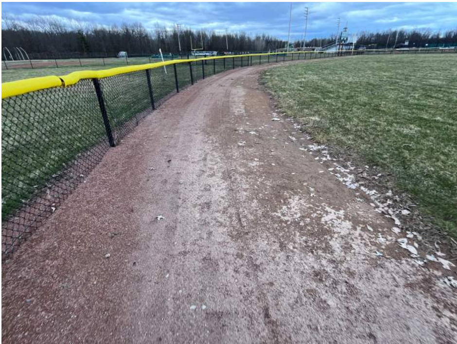
Existing Varsity warning track – Add clay, raise low areas and straighten edge.