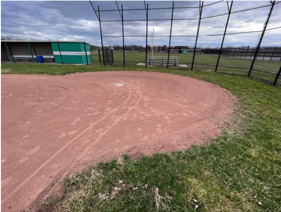
Typical existing home plate area – Reconstruct, add clay and new home plate