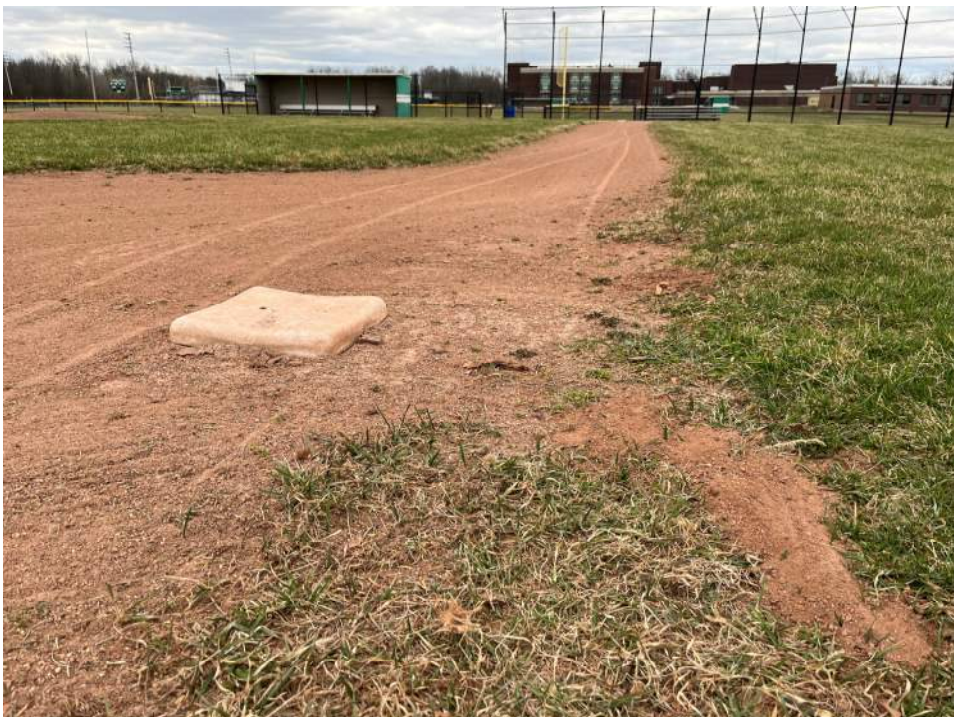
Typical existing clay infield to grass baseline edge condition – Add clay and straighten edge, new bases.