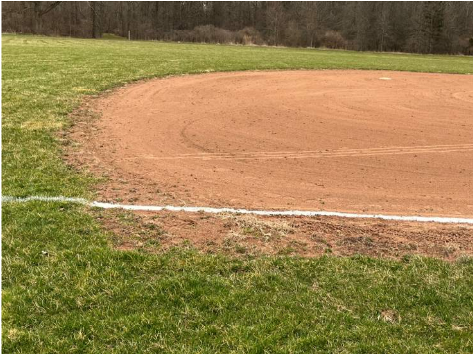
Typical existing clay infield to grass outfield edge condition – Add clay and straighten edge.